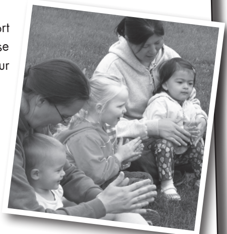
Reach for the Stars 2010, our fifth annual fundraiser, will help the FRC maintain its free programs for local families.