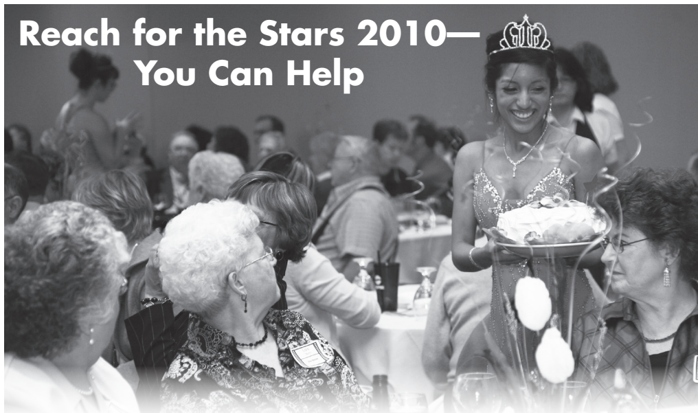
Members of the Baldwin-Woodville royalty helped show off cakes before the dessert auction at Reach for the Stars 2009.

Reach for the Stars 2010, the Family Resource Center's 5th annual fundraising gala, will be held on Sunday, April 25, 2010. We are busy planning the big event, but we need your help to make the night a success. How can you help us plan and enjoy a fun, successful Reach for the Stars?